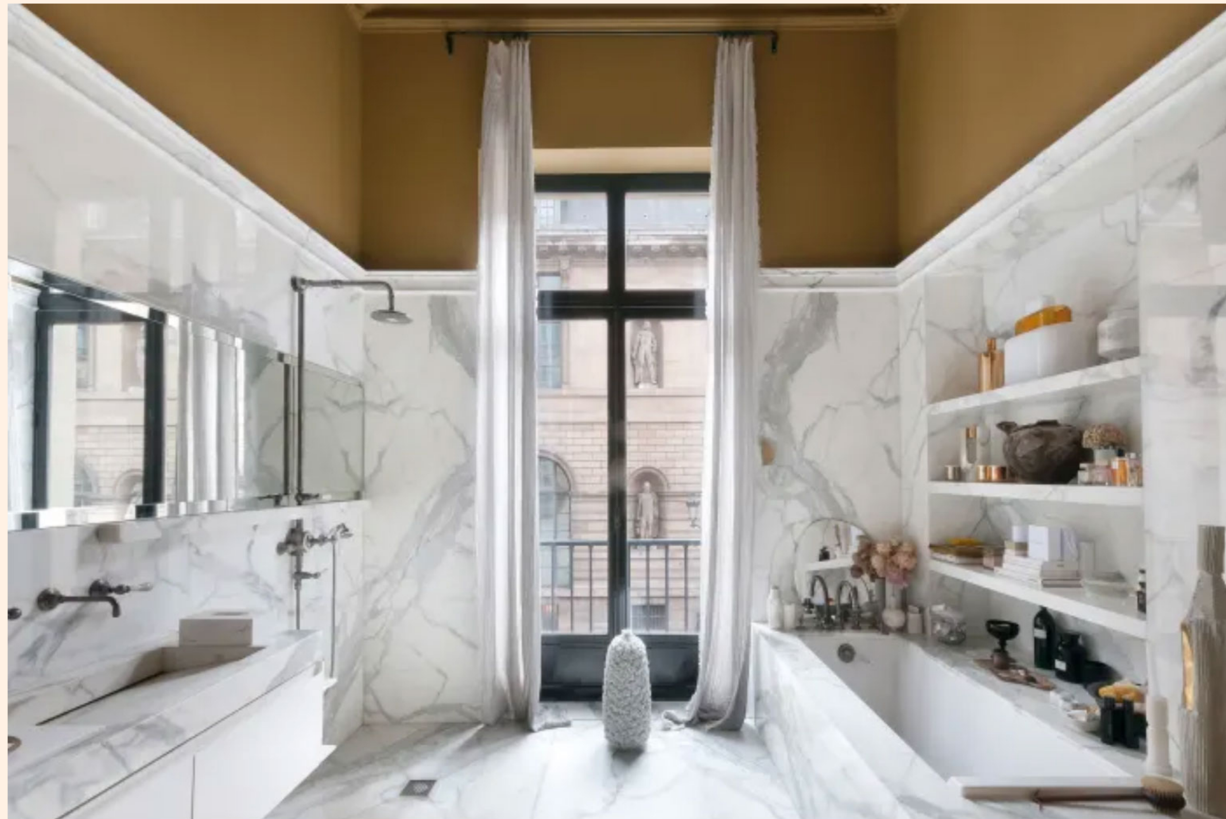
The 260sq m apartment overlooks the Louvre