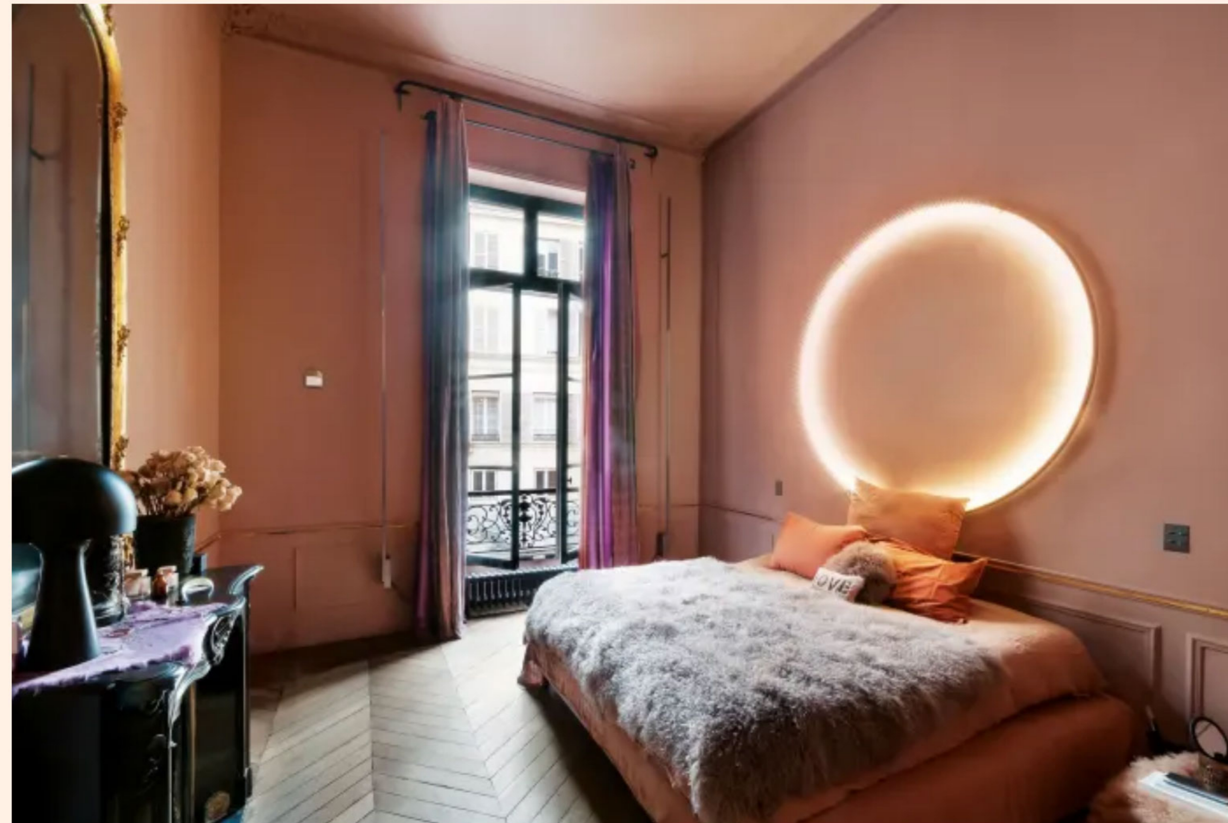
An apartment in Paris's first arrondissement, €5.5m through Savills